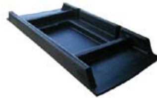
UG2058 - Shelf to suit UG2033 G3 Pit