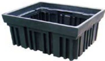
UG2030 - G3 Collar