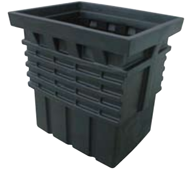
UG2033 - G3 Pit