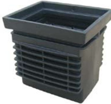
UG2032 - G2 Pit