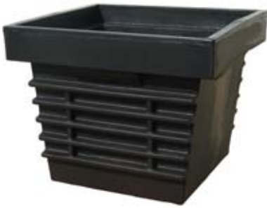
UG2031 - G1 Pit

Viscount Rotational Mouldings Pty Ltd have a range of infrastructure products that suit the growing demand to bury gas meters and valve connections. Developed in conjunction with the Energy Authorities the range of pits and lockable lids cover most requirements. The larger G3 pit has options including a 240mm extension collar, removable shelf or the option of either the rotationally moulded class A lockable lid or the heavy duty reinforced class B lockable resin lid. All lids are supplied with keyhole security plugs to keep the lock stem free of foreign material and ready to use. The resin lids also have the option of a galvanized support frame that can be used in high traffic areas.