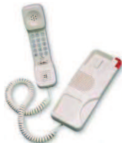
Trimline I With message waiting Single-line telephone