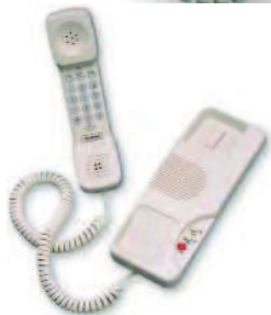
Trimline II Without message waiting Two-line telephone, Hold, line select buttons with line status LEDs

Shown: Trimline II With message waiting Two-line telephone, Hold, line select buttons with line status LEDs