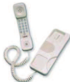
Trimline I Without message waiting Single-line telephone